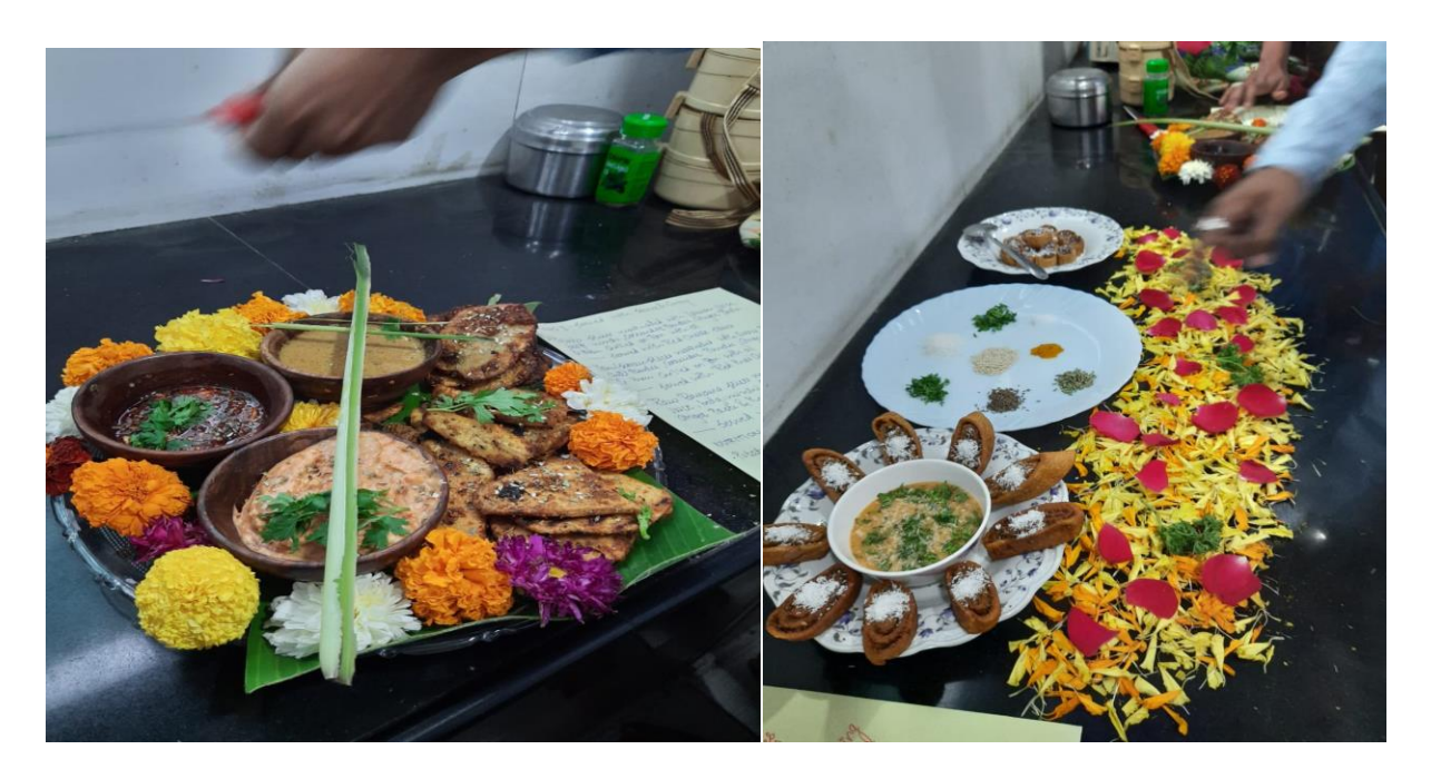
Dish Presented during World Food Day