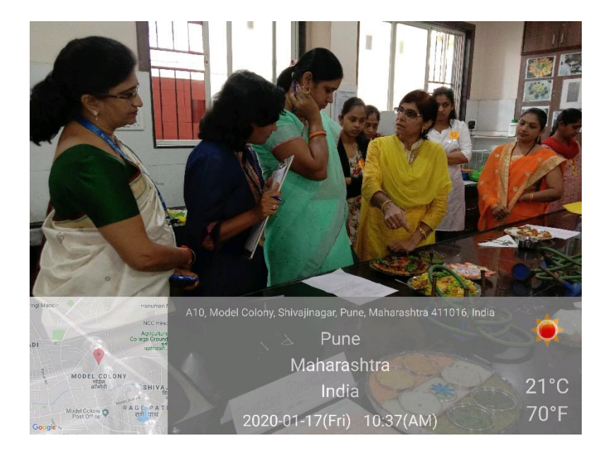
Fig.: Judge\ judging\ dish\ presented\ at\ Modern\ Chef