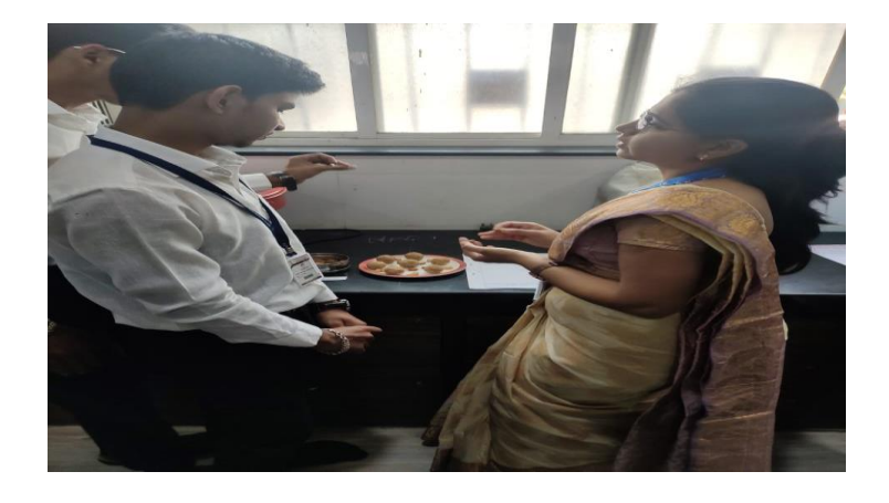
Judge judging the Innovative Product Development competition