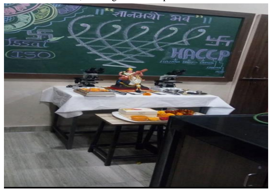
Dasraa Pooja at B.Voc Lab

Dasraa Pooja was celebrated on 8 <sup>th</sup>October, 2019. The Department was decorated with flowers and rangolis. Creative sketch of Goddess Saraswati was drew by students. All the instruments, notebooks, registers were worshiped and pooja was performed. F.Y.B.Voc, S.Y. B.Voc, T.Y.B.Voc students, teaching staff were present for the event.